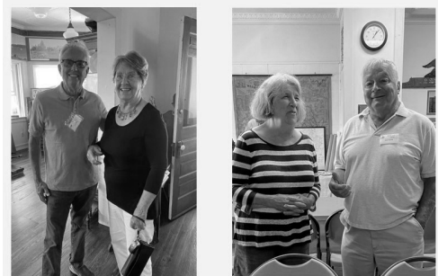
Some attendees at the 20th Anniversary