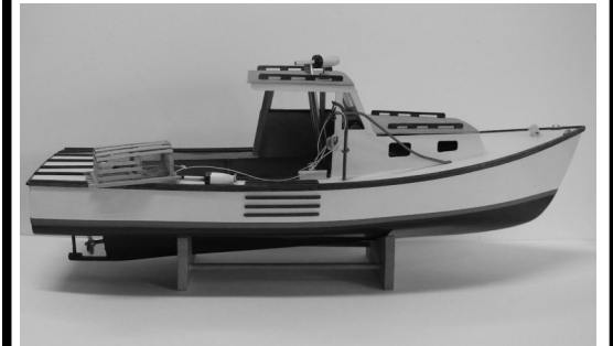
Model of the Maine lobster boat.