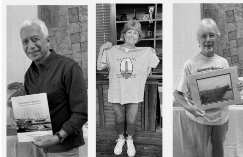
Some 20th Anniversary door prize winners