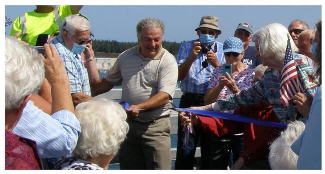
August 16, 2020

Finally, on February 27, 1968, the Maine Supreme Court declared that the Maine Legislature was within its rights to discontinue toll-taking on the Beals Island bridge.