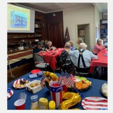
Some of the attendees socializing, enjoying the food, and watching 20 Years In 20 Minutes