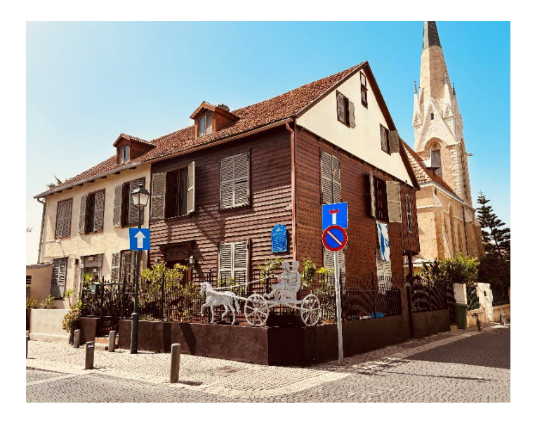
Sculpture at the Maine Friendship House Museum in Jaffa, Israel.