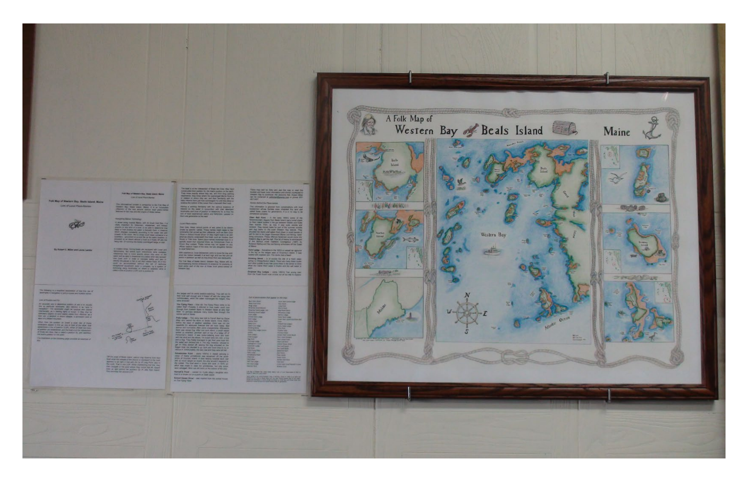
Folk Map of Western Bay, Beals Island, Maine: Lore of Local Place-Names hanging in the JHS Museum.