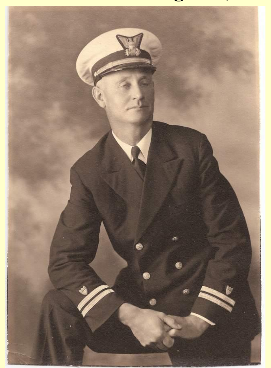
Lt. Cmdr. Osmond C. Faulkingham, USCG - 1940s