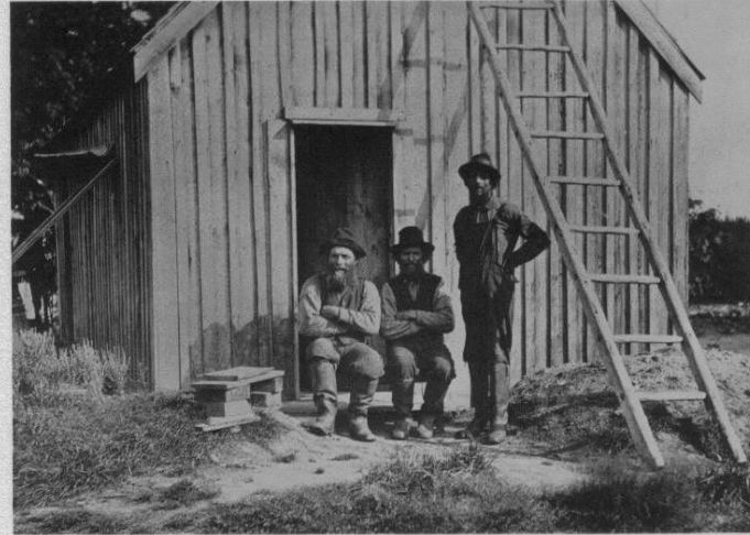
11C. The Hermits on Little Spruce Island in 1880's.